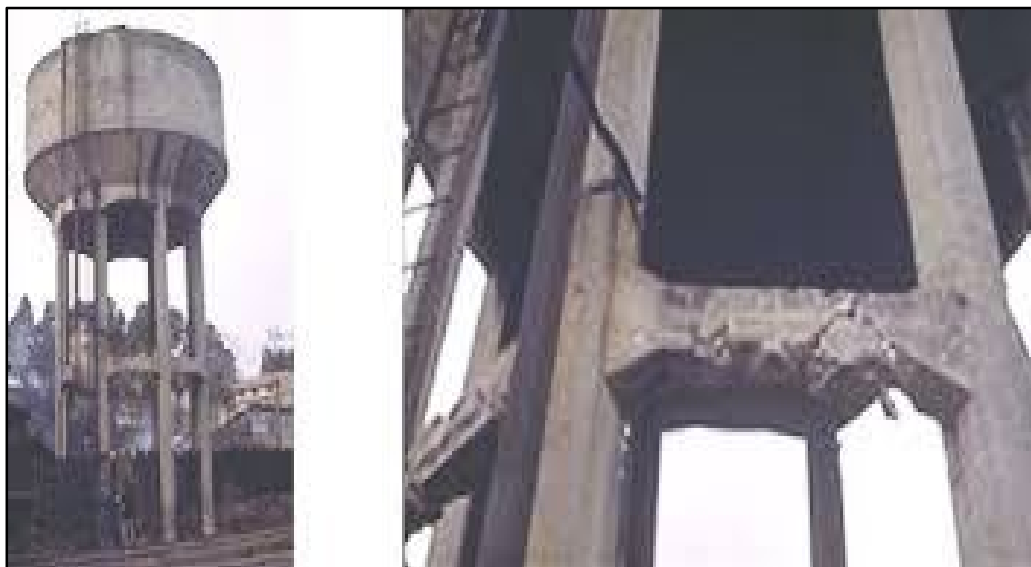
Figure 2: Elevated water tank of PuertoVaras Hotel, May 22nd, 1960.

One of the foremost powerful earthquakes recorded in history caused by the tsunami at the north eastern part of Japan is of magnitude of 9 on richter scale. It affects the 8 million households 270,000 buildings were destroyed. This damage also leads the destruction of water and waste water structures and distribution system.