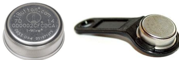
Figure 2: Picture of iButton along with key fob attachment.

iButton as an e-commerce device would be the best solution to avoid the problems and limitations of the past. iButtons have the ability to be embedded in rings, wallets, watches and a number of other personal accessories. While most smart cards and credit cards are stored by people in their wallets or hand bags, and therefore become a very potential targets for thieves. But not so for iButtons, as they can be stored in places, or in any device that a person wishes.