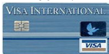
Figure 1: VISA smart card.

Electronic Commerce (also known as E-commerce) is one of the most important aspects of the Internet. It allows people to exchange goods and services immediately and with no barriers of time or distance. Any time of the day or night, you can go on-line and buy almost anything you want. Today, credit cards are by far the most popular form of e-commerce transactions across the Internet, since they are the only items currently in circulation that are able to adapt to the technological world of today. They use a form of magnetic strip that holds identification number that links itself to a bank account. However, for payments across the Internet, consumers must type in their credit card number onto a web page to buy an item.