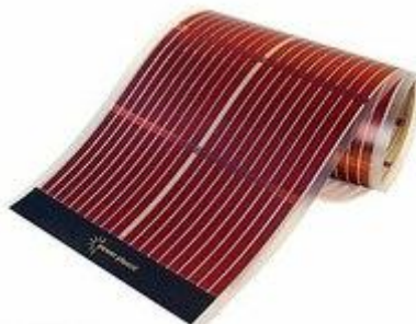
Fig. 1 Printable Solar Cell