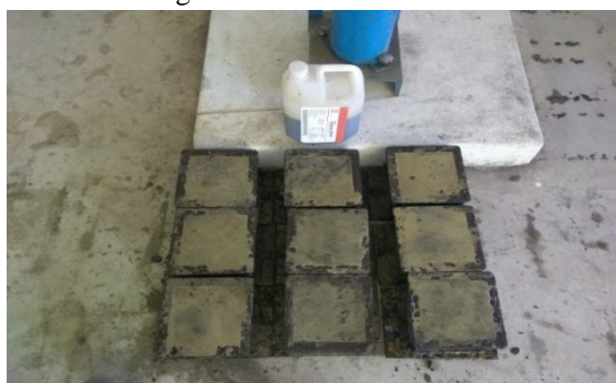
Fig 4.1 Conventional cubes

Based on Mix Design we cast totally 42 Numbers of cube (6 No of conventional concrete & 12 no. of cube for each 10%,20% & 30% replacement of cement by using ceramic waste).The ceramic cubes are cured by using Normal water .