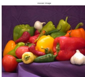
Figure 5 : mosaic Image