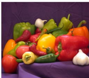
Figure 2 : Secret image