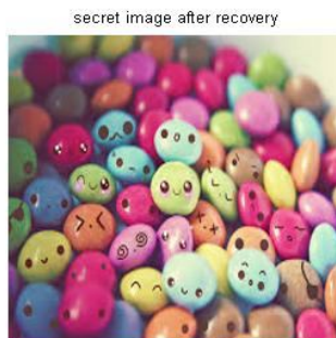
Figure 6 : Secret image