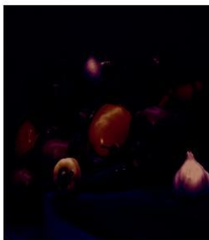
Fig.4 Color Transformed Image