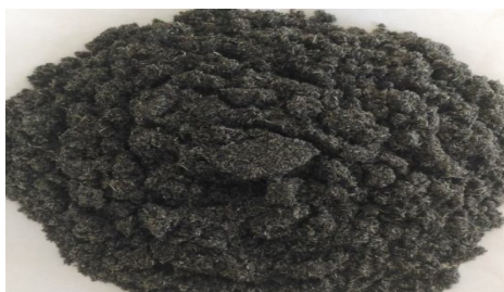
Fig1. Rice Husk Ash

2) Rice Husk Ash(RHA): Rice milling generates a by-product known as husk shown in figure1. This surrounds the paddy grain. During milling of paddy about 78% of weight is received as rice, broken rice and bran. Rest 22% of the weight of paddy is received as husk. This husk is used as fuel in the rice mills to generate steam for the parboiling process. This husk contains about 75% organic volatile matter and the balance 25% of the weight of this husk is converted into ash during the firing process, is known as Rice Husk Ash (RHA). This RHA in turn contains around 85% - 90% amorphous silica. So for every 1000 kg of paddy milled, about 220 kg (22%) of husk is produced, and when this husk is burnt in the boilers, about 55 kg (25%) of RHA is generated. India is a major rice producing country, and the husk generated during milling is mostly used as a fuel in the boilers for processing paddy, producing energy through direct combustion and/ or by gasification.