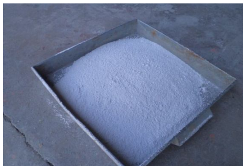
Fig2. Tandur Stone Slurry Powder

3) Tandur Stone Slurry Powder (TSP) : TSP is produced from limestone, shown in figure2. Limestone has numerous uses: as a building material, as aggregate for the base of roads, as white pigment or filler in products such as toothpaste or paints, and as a chemical feedstock. Limestone is very common in architecture, especially in Europe and North America. Many landmarks across the world, including the Great Pyramid and its associated complex in Giza, Egypt, are made of limestone. Limestone is readily available and relatively easy to cut into blocks or more elaborate carving.