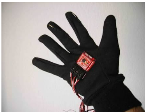
Figure 7.1 MEMS attachment

The gestures which are the inputs for the MEMS sensors will be converted to text and voice it will be displayed on mobile screen and the gestures can be transmitted using Bluetooth Module to a smart phone where gesture to text and speech conversion takes place using Hardware setup of the module which is shown below. This includes MEMS sensor gloves, microcontroller, ADC, Bluetooth device and Android device.