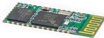
Figure 1.3 Bluetooth module

It is a class-2 Bluetooth module with Serial Port Profile, which can configure as either Master or slave. A Drop-in replacement for wired serial connections, transparent usage. You can use it simply for a serial port replacement to establish connection between MCU, PC to your embedded project and etc.