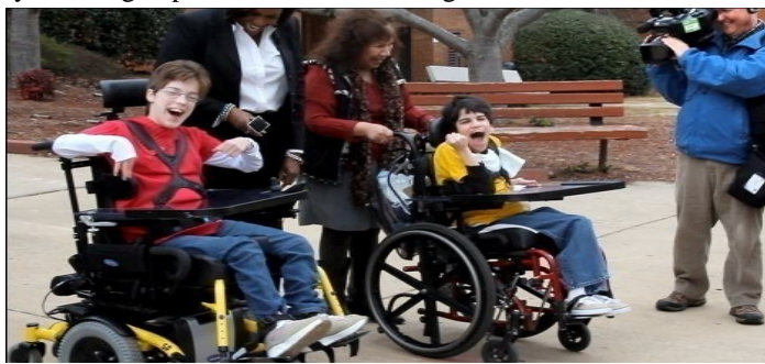
Figure1.1: Disabled Persons

The main aim of this paper is to design and construct a Dumb, deaf blind monitoring system using android application and image processing. The user can wear this device near to his arms and hand, with the simple head movement and hand movement, he can request the basic needs like water, food or medicine by using IR rays. For example if the tilt is to the right side sensor will be “ON” for the first .In the same way, if the tilt is to the left side then another sensor is going to be controlled. The tilt is in upwards or downward direction the related need will be announced. This device is very helpful for paralysis and physically challenged persons as shown in Figure 1.1.