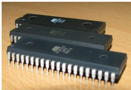
Figure 1.2 Microcontroller

When the Microcontroller is powered up, the Program stored in the ROM of Microcontroller starts executing and microcontroller functions as per the Program. In this project the Microcontroller as in figure 1.2 keeps on checking the signals are arriving at the input port and display the message on LCD. A microcontroller is an economical computer-on-a-chip built for dealing with specific tasks, such as displaying or receiving information through LEDs or remote controlled devices. The most commonly used set of microcontrollers belong to 8051 Family. 8051 Microcontrollers continue to remain a preferred choice for a vast community of hobbyists and professionals. Through 8051, the world became witness to the most revolutionary set of microcontrollers.