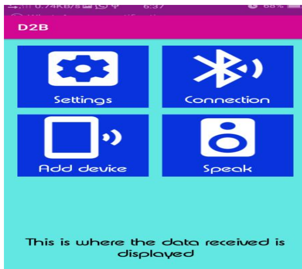
Figure 7.4 Home Page

This application receives the data from the hardware device via Bluetooth and displays the text message and announces voice alerts as shown in Figure 7.4.