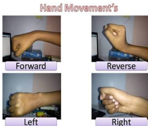
Figure 7.2 Hand movements