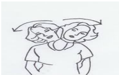
Figure 7.3 Head movement

The movement of the head will indicate some message which is set by the guardian to monitor the disabled person. The movements or gestures are like