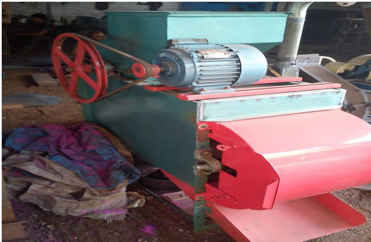
Photo 1 Final Assembly of Groundnut Decorticator