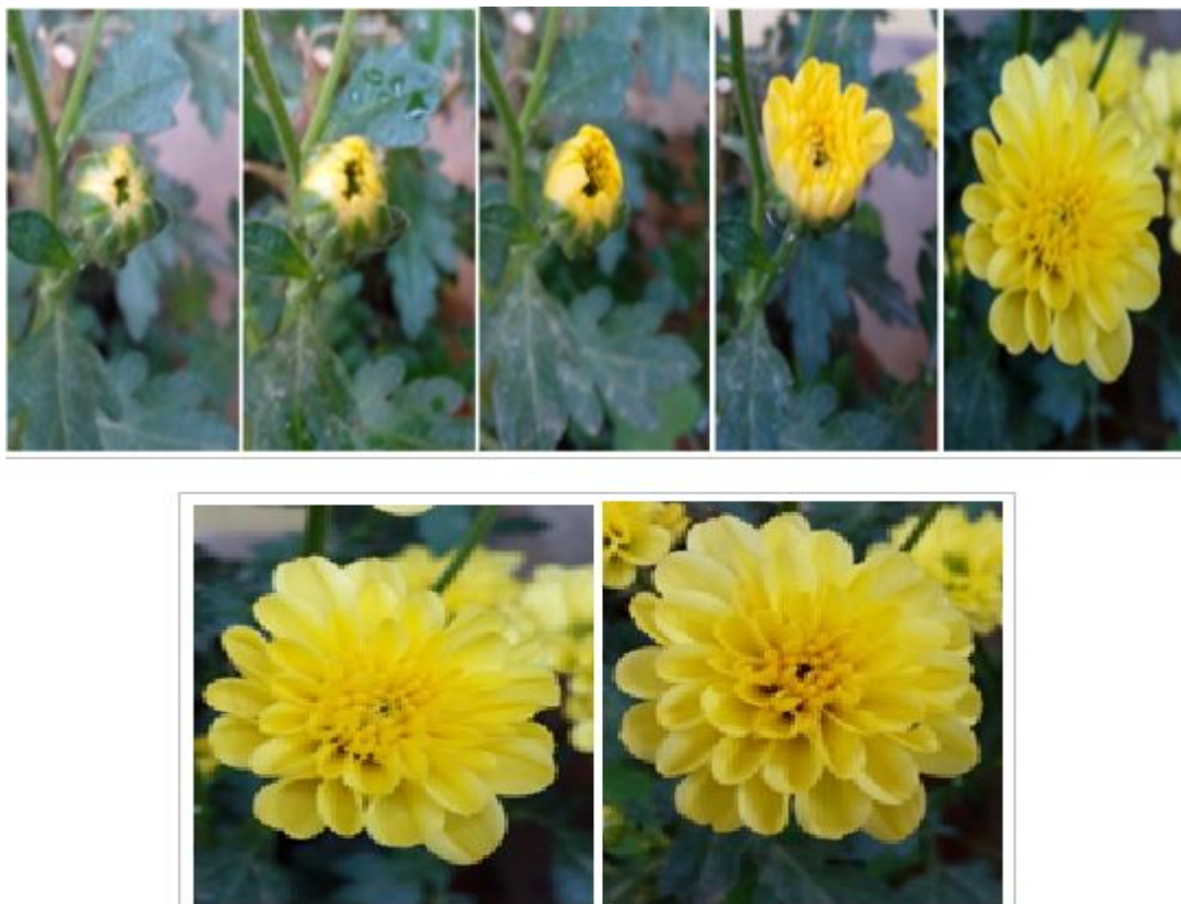
Fig. 1. Photograph of Chrysanthemum ( Dendranthema grandiflora ) flowers at successive stages of development.

Fig. 1 shows the photographs of a flower chrysanthemum at successive stages of development. The photographs have been taken with the help of a smart phone after every twelve hours to investigate its nature of growth in time. As may be inferred from the photographs, the linear growth of the flower takes place from some non-zero value and after some time becomes maximum and remains constant. The situation is well illustrated with the help of Fig. 2 where we have plotted the linear dimension of the flower (in cm) against time. For every twelve hours the measurements have been made. As may be inferred from the figure the growth of the flower initially indicates exponential growth from some non-zero value, after which there is a rapid growth in linear dimension and it