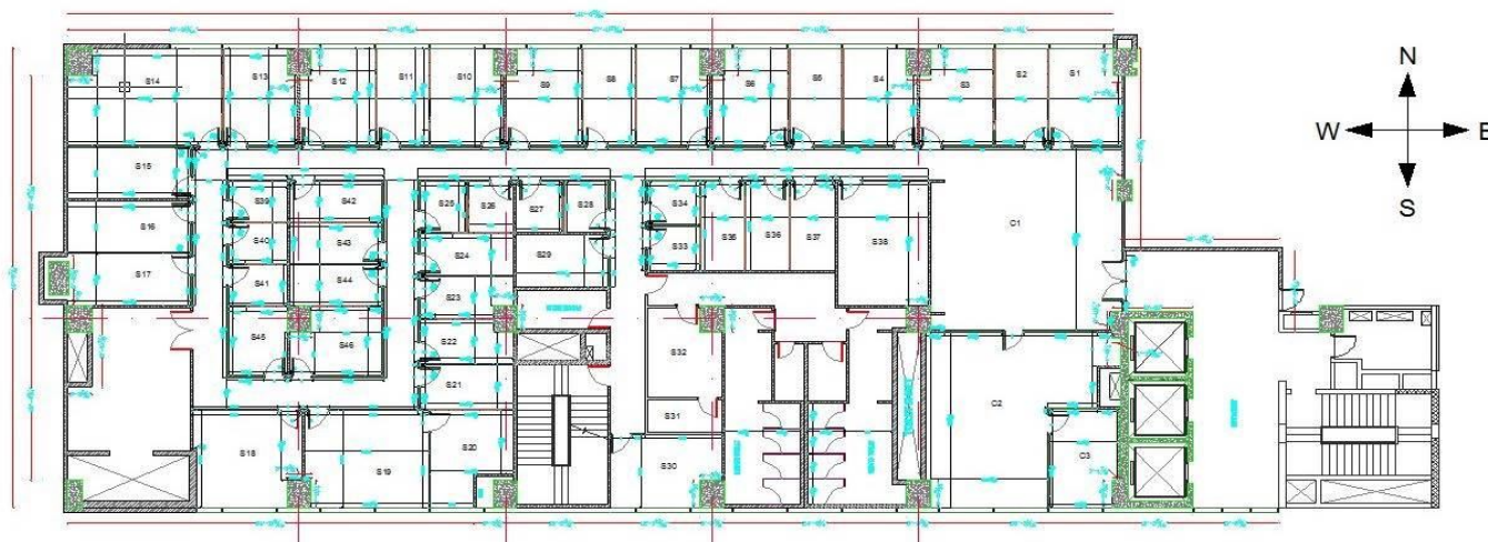
Fig. 2 Building Plan

The building chosen is intended to be used as a shopping mall. The building is proposed to be located in Hyderabad, India. It is provided with a complete glass section on the north and south sides. The building comprises of two floors i.e. a ground floor and the first floor and these two floors are similar to each other, thus, they are referred as typical floors. The total area of the building is about 9300 square feet and it comprises of different sections including the areas with and without air condition system. There are different kinds of spaces in this building as it is a commercial building such as lobby, lift section, corridor, spaces for shops or outlets, air handling unit room where the indoor unit of the air conditioning system is located, toilet section and many other spaces. Hence, a total area of about 7900 square feet out of the overall building area is supplied with the conditioned air and about 51 spaces are considered while designing an air conditioning system. The maximum occupancy of this building ranges up to about 284 persons per each floor and the number of occupants that can be accommodated within each floor is estimated from the ASHRAE standard that specifies about 30 square feet per person. An important consideration in this aspect is, the number of occupants is selected based on the area to be air conditioned and not the total building area.