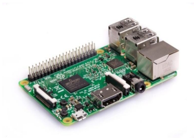
Fig. 2. Raspberry Pi 3