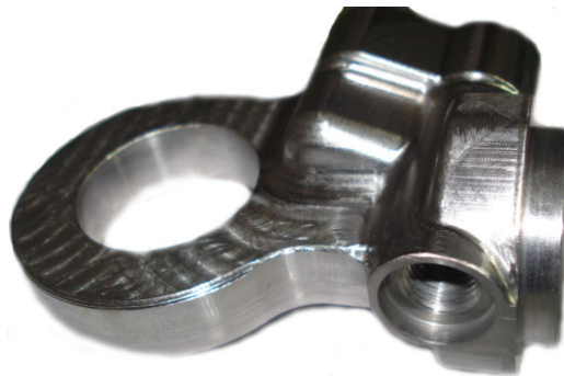
Fig.1 rear cover

This is our project component. It is named as “REAR COVER” also called as “DAIMLER”. In this product is used in automobiles. Application of this product is load lifting assembly in trucks, Lorries etc.