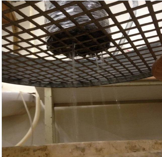
Fig.1 Water passing through the pervious concrete specimen during permeability test

Formulae: Observations are started after steady state of flow has reached. The heads at two successive time intervals 't1' and 't2' is recorded as 'h1' and 'h2' respectively.