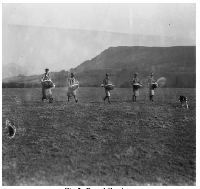
Fig.2: Broad Casting