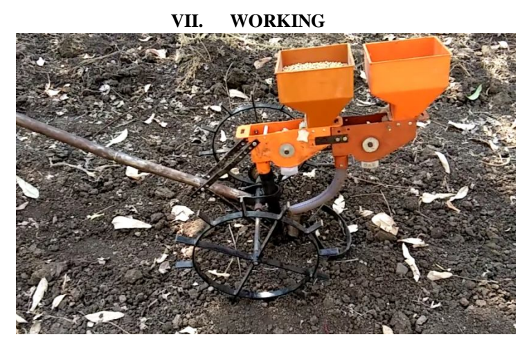
Fig.3: Seed Sowing Machine

To achieve the best performance from a seed drill or planter, the above factors are to be optimized by proper design and selection of the components required on the machine to suit the needs of the crops. The seed drill or planter can play an important role in manipulating the physical environment. The metering system selected for the seed should not damage the seed while in operation.