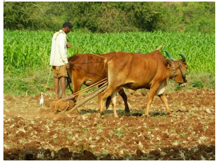
Fig.1:Line Sowing Technique

Mechanization enables the conservation of inputs through precision in metering ensuring better distribution, reducing quantity needed for better response and prevention of losses or wastage of inputs applied. Mechanization reduces the unit cost of production through higher productivity and input conservation.