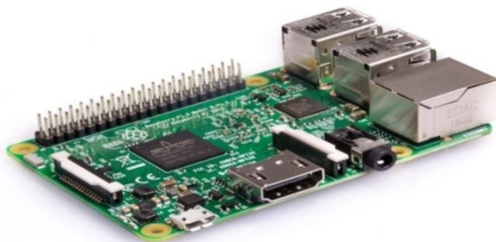
Fig. 2. Raspberry Pi 3