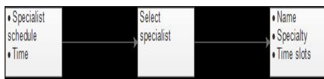
Fig:Flow according to selection of doctors