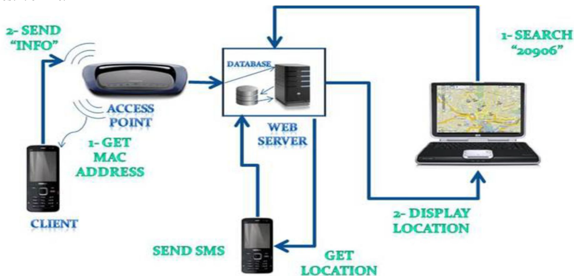
Figure 1: System Architecture