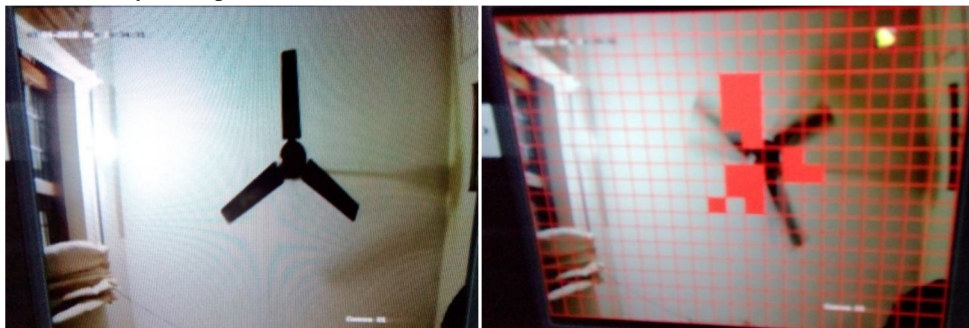
Fig.1 Real Time Motion Detection

To get the surveillance stream in a monitor it requires processing of current captured content, this has to be done by a PC processor. But it is tedious process and memory sharing for PC is too high in terms for real time surveillance. This due to the fact that for compression it is better to have hardware compression rather than software compression. Modern CCTV uses H264 compression format. In normal streaming not all the frames are of same size and don't require the same amount of work to process regardless of compression. Mean while PC itself will be processing GUI and other running parameters. This will lead to lot of memory wastage and it is better to employ hardware compression using configurable parallel architecture employing strip based memory partitioning. Normally for the vision application Raspberry pii is used as hardware processor. Its yield is good. But when the frame rate increases with increase in object to detect and track, it will slow down surveillance. More over quality and computation with regards to algorithm will begin to crack down. It will be wise to use Matrix display video cards plugged with processor; this will initiate the computation process in its own by three phases.