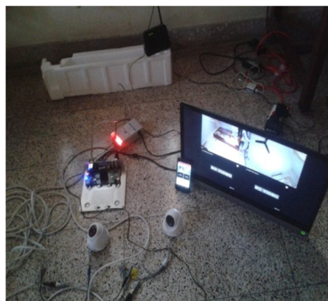
Fig. 3 IOT implemented CCTV with MDI Card