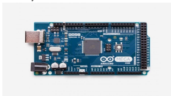
Fig.2 Arduino device

Author suggests the model for describing the auto feeder mechanisms with the help of solenoid operated valve. The auto feeder is operated on the solenoid valve which release ball at definite time interval and the solenoid valve is operated on arduino device of 5 volt (9) as shown in fig. 2 which run on electricity 10 (10)