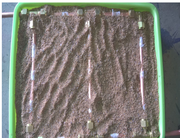
Figure 1: Set-Up of Copper pipes in Sand

The Experimental Set-up has been designed as follows consisting of copper pipes, sand, water pump and an air blower as shown in Fig(1).