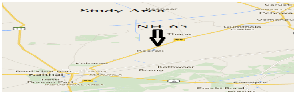
Fig-1. Study Area

The study area selected for the present study is a road stretch of NH-65 from Kaithal to Pehowa. The selected road stretch is a very busy highway and it is about 30 Km long. The two lane highway faces mixed traffic including the commercial vehicles, loaded trucks, cars, two wheelers, three wheelers and buses. There is a large number of loaded trucks which passes the highway making the traffic situation more complicated to understand. The study area is shown in Fig-1. The traffic along NH-65 is growing at a rapid rate.