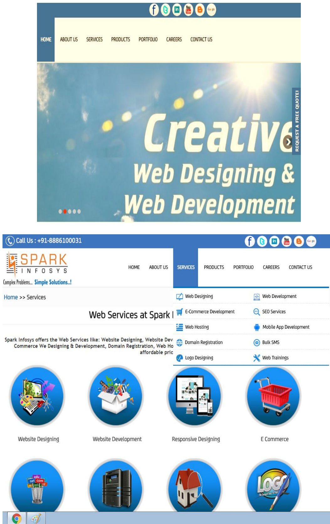
Fig1.2: Exam service system