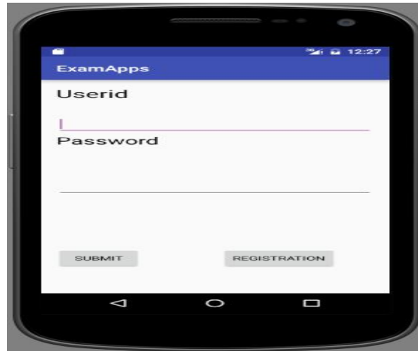
Fig 2: Module I- Login page