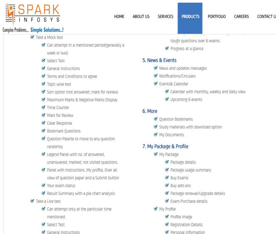
Fig 1.3 Exam user selects the MCQ