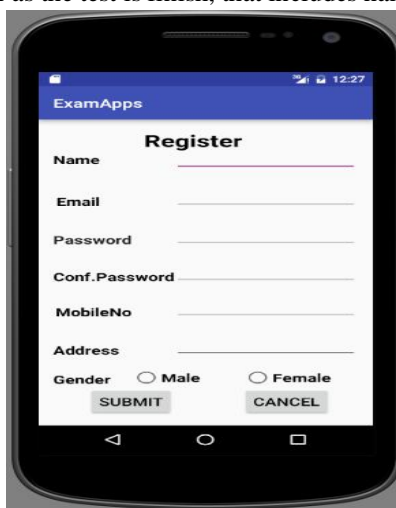
Fig 3:ModuleII- Registration page

“Exam Android Application” is designed for Educational Institutes (like schools, universities, training centers).The app will handles all the operations, and generates reports as soon as the test is finish, that includes name, mark, time spent to solve exam.