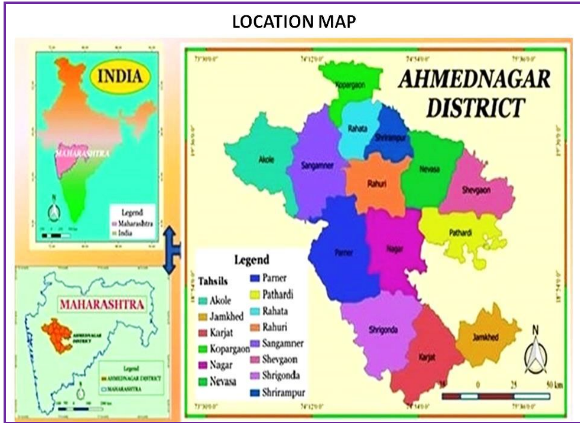
Fig.1 Location Map of Ahmadnagar District

and 75° 5' east longitude. Topographically entire district classified in to three parts like, The Sahyadri ranges, Plateau region and Bhima, Godavari basins (Fig. 1).