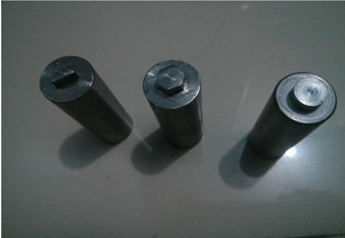
Figure 1: Triangular, Hexagonal and Triangular tool pin profiles