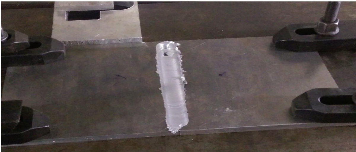
Figure 3: Less formation of flash and chips in the weld

In order to obtain the sound weld joint, the tool profile should be designed in such a manner that it results less formation of flashes and less chips formation as shown in the Figure 3.