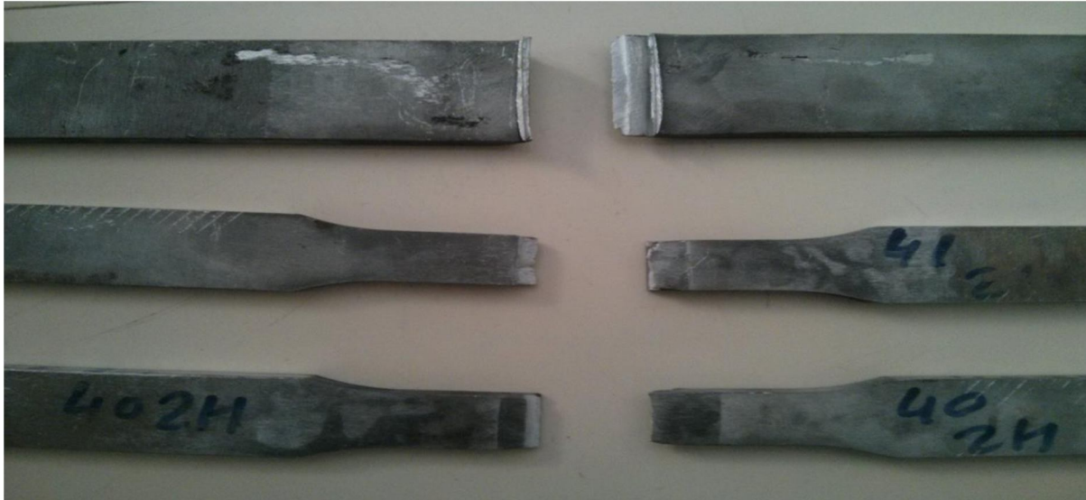
Figure 5: Failure occurrence at the weld zone of the tensile test specimens