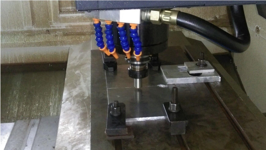
Figure 2: Plates butt welded on the fixture

In order to obtain the sound weld joint, the tool profile should be designed in such a manner that it results less formation of flashes and less chips formation as shown in the Figure 3.