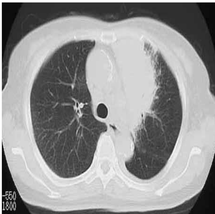
Figure 1.1 An Example of CT image