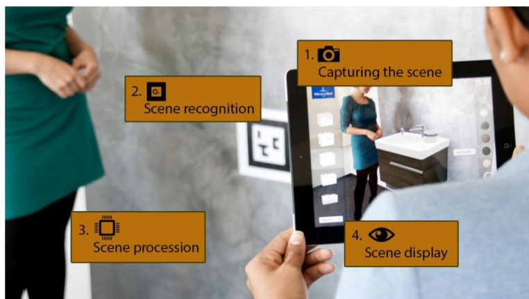
Fig. 3 Augmented Reality Display Principle