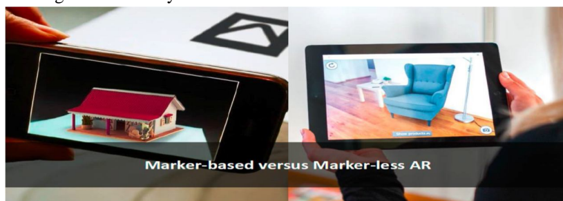
Fig. 2 Marker Based versus Marker Less AR

There are 2 ways to experience Augmented Reality – with Marker-based or Marker-less