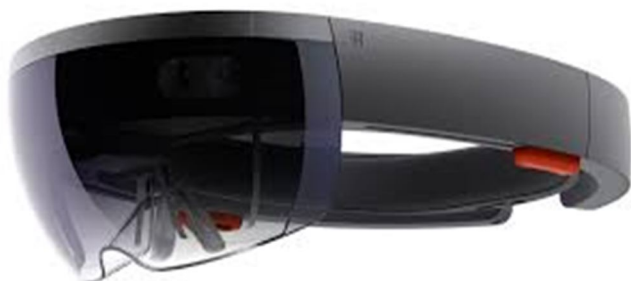
Fig. 4 Microsoft Hololens

Microsoft Hololens is a smart glass which is the first cordless device, self-contained holographic computer running Windows 10. The hololens similar to Google glass in that it uses AR (Augmented reality) technology. Most advanced holographic computer the world has ever seen its a self –contained computer. Price of this device $3000. Wear hololens headsets and collaborate in augmented reality give by Windows 10. This Windows 10 is the first platform to support holographic computing. It is fully apart i.e no wires, phones or connection to PC is needed. Microsoft Hololens allow you to pin hologram in your physical environment and provide a new way to see your world. This hololens is equipped with advance sensors and a new Holographic Processing Unit (HPU) that estimate the world around the user and is able to run without any wires while preparing terabytes of data from the sensors in real time. Holograms are made entirely of light.