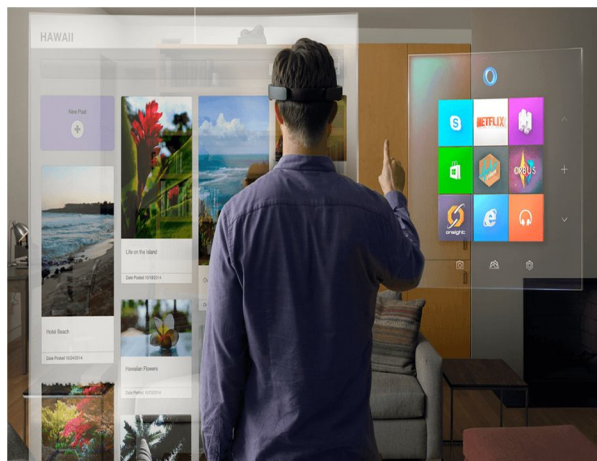
Fig. 6 Hololens Experience in real world