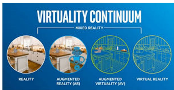
Fig. 1 Reality – Virtuality Continuum

In 1990, the former Boeing researcher THOMAS P. CAUDELL gives the concept of 'Augmented Reality' then more researches are going on this technology such as in 2013, Google takes an open test for Google Glass augmented reality. The technology is growing fast in every sector over the world. The basic goal of system is to enhance the user's perception of and interaction with the real world and build up the real world with 3D virtual objects that appear to coincide in the same space as the real world. Augmented Reality aims at simplifying the user's life by bringing virtual information not only in the existing environment, but also to any indirect view of the real-world environment, such as live-video stream. Examples of AR such as: Google Glasses, Head Mounted Display (HMD), Hololens.