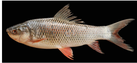
Fig 1. Sample captured Images