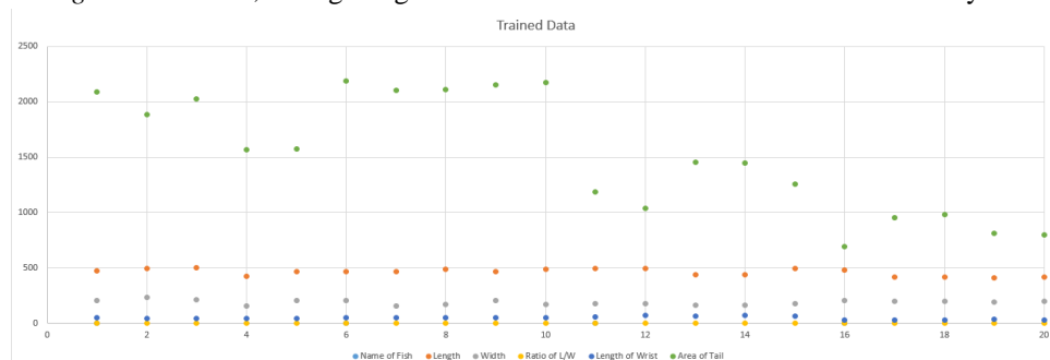
Fig 4. Representation of Trained Data Set

5) Preparing the Training Database: So, after getting all feature vector we trained database with many fishes.