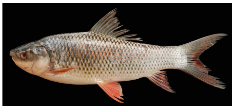
Fig 1. Sample captured Images