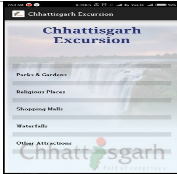
Figure: 2. Home Page