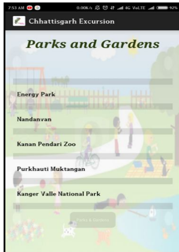
Figure: 3. Parks & Gardens