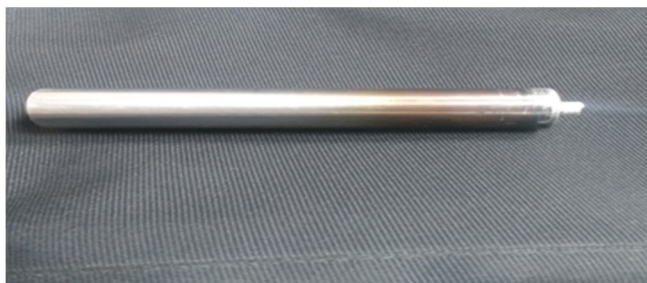
Fig. 1 Friction stir tool