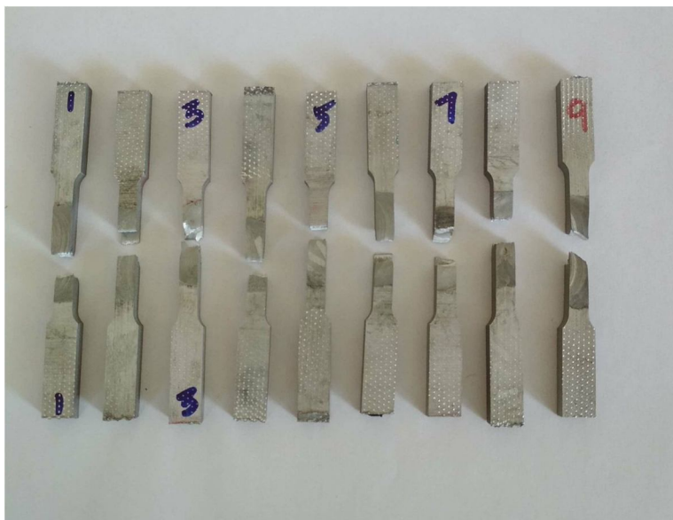
Fig. 2 After Tensile Testing

Mean response of raw data and S/N ratio of TS for each parameter at level 1, 2 and 3 were calculated and presented in Figure 3. It was observed that the larger S/N ratio corresponds to better quality characteristics. Therefore, optimal level of process parameter is the level of highest S/N ratio. Mean effect and S/N ratio calculated by statistical software indicate that the TS was maximum while using the parameter level of 2000 rpm Spindle Speed, 4 mm/sec weld speed, 0.1 mm shoulder penetration. Also the response table ranking given in Table III, interprets the degree of parameter which influences on response. The first dominant parameter was a welding speed which is followed by spindle speed, and plunge depth.