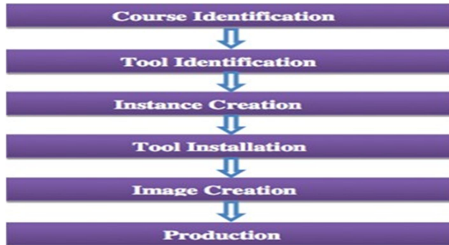
Figure-2. Guidelines in implementing software engineering tools on cloud [1]

Another issue featured is the readiness to adjust this new innovation. From the aggregate audit of past study took care of with three colleges which are Asia Pacific University of Technology and Innovation Malaysia, University Technology Malaysia and University Malaya Malaysia, exchange of results acquired where software engineering undergraduates confront trouble of similarity, accessibility and permitting of the software while addresses are worry by the accessibility of the labs for situations for immense classes and unmanageable gatherings. Moreover, this paper gives a rule in executing the software engineering instrument in cloud with depictions in Figure 2 as underneath.