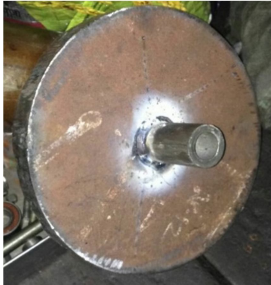
Fig.3. Fly Wheel

The primary function of flywheel is to act as an energy accumulator. It reduces the fluctuations in speed. It absorbs the energy when demand is less and releases the same when it is required.