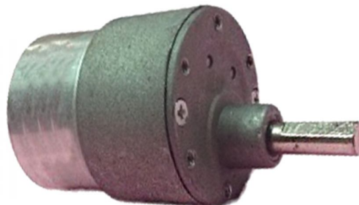
Fig. 4. Generator

It is a device, which converts mechanical energy into electrical energy. The generator uses rotating coils of wire and magnetic fields to convert mechanical rotation into a pulsing direct electric current. A generator consists of a stationary structure, called stator, which provides a constant magnetic field, and a set of rotating winding called the armature which turns within that field