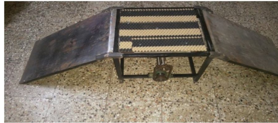
Table.1. Bill of Component