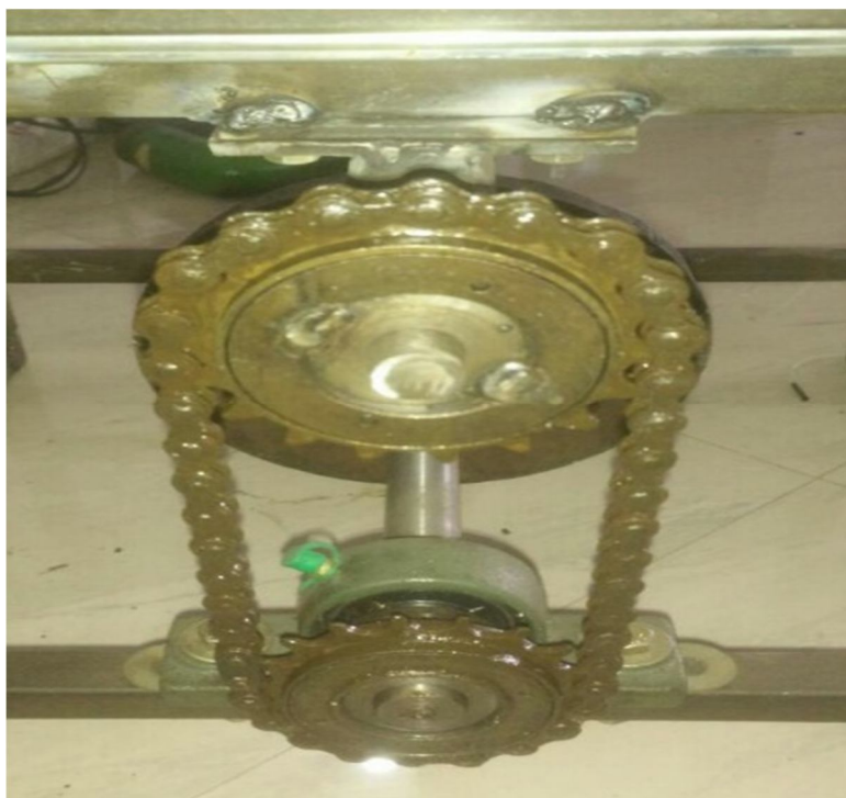
Fig.5. Sprocket and Chain Assembly