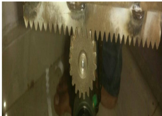
Fig.1. Rack And Pinion Assembly

The selection of rack and pinion used in the power generation unit is based on load applied on the unit and the material of the rack and pinion.