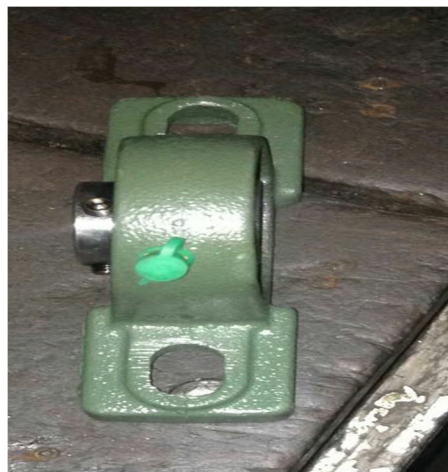
Fig.2. Pedestal Bearings

Bearing is used to mount the shaft used in power generation unit. The purpose of it is to reduce the friction between shaft and the casing. Thus, they reduce the friction and transmit the motion.