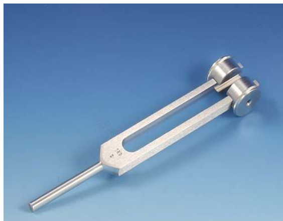
Fig 3: Tuning fork