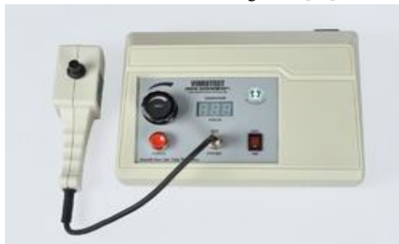
Fig 5: Biothesiometer

at which patient cannot feel the vibration. The same process was then applied to record the measurement on the upper limb. An upper limb with joints of the middle finger, fingertip, wrist, and elbow were tested. The participant was prone during the testing procedure and cannot able to see the biothesiometer knob as shown in figure 5. [21]