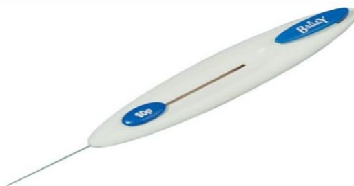
Fig 1: 10 g Semmes-Weinstein monofilament

The SWMT is a general diagnosing tool for evaluating the loss of pressure sensation. The most common monofilament used for screening was 0.5g, 2g, 10g, 50g, and other different types. It shows the magnitude of the force on the filament as shown in figure 1 at the time in which monofilament is just bent. [14]