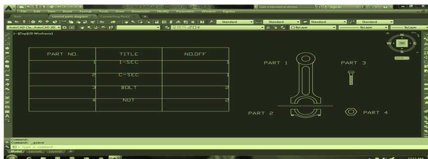
Fig no 3 Part Diagram

It helps in understanding the list of parts given and their exact dimensions and tolerance for forecasting interrelationship failure modes