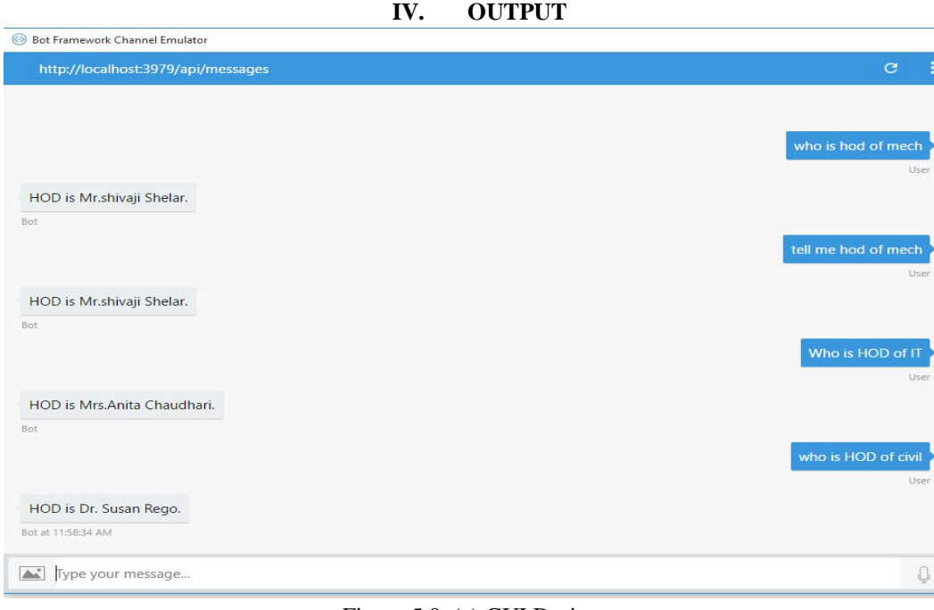
Figure 5.0. (a) GUI Design.

In this system, user will interact with the bot through the web interface of the bot, the web application will be connected to the bot with the help of the bot connector which will create the object through which will communicate with the bot. the query entered by the user will be sent to LUIS.ai where it will be processed and Intent and Entity of the user query will be retrieved and the corresponding response will be fetched from database. This way any query regarding college will be answered.