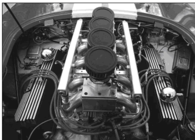
Commercial Model developed by Ford