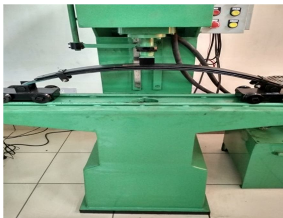
Fig. 3 Fatigue testing of steel spring

1) Fatigue test of steel leaf spring: Hydraulic load test machine was used to determine fatigue strength which include stroke of 0 – 150 mm as shown in Fig. 3. According to IS 1135: 1995 standards, fatigue strength of leaf spring must be stand above the 100000 cycle [7]. After initial start of machine, loading and unloading cycle was repeated until the end of the test was reached. The hydraulic test rig initial deflection was 9 mm and the initial stress is 203 MPa. Final stress of the spring was 17.5 mm and the stress is 304 MPa. It was found that fatigue life of the steel spring was above 100000 cycles.