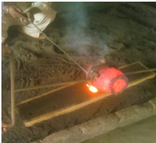
Fig. 1 Casting of MMC – Molten MMC being poured into mould

Electric muffle furnace was used to heat the aluminum up to 850°C. The mould of leaf spring was prepared by steel leaf spring. Alongside, boron carbide was also pre-heated to about 500°C temperature in order to remove the dissolved gases which would have otherwise resulted in the formation of blow-holes, during the casting process. When aluminum temperature reached to 850°C than boron carbide was added in very control manner to the crucible. The mixture of aluminum and boron carbide was stirred with the help of the stir casting machine at 400 rpm for about 10 minutes in order to ensure homogeneous mixture of the materials. When the materials got properly mixed, the mixture was poured to the prepared mould of the leaf spring as shown in Fig. 1. After solidification composite leaf spring was removed from the mould.