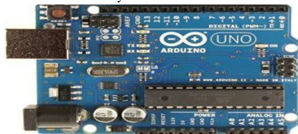
Fig: Arduino Uno

It is the basic controller used in wireless colour indication system.