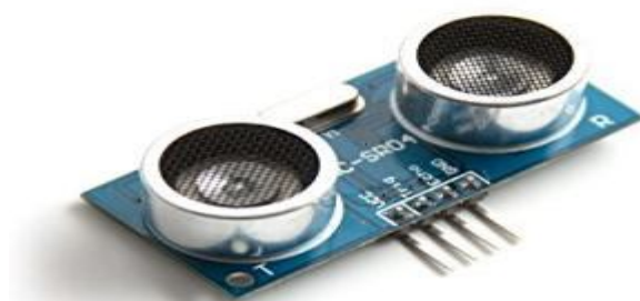
Fig: Ultrasonic Sensor

The Ultrasonic sensor is utilized with Arduino so as to compute separations from objects. So, in the event that we begin with the ultrasonic sensor it's an IC that works by sending a ultrasonic heartbeat at around 40 KHz. It at that point sits tight and tunes in for the beat to resound back, calculating the time taken in microseconds. It needs a 5v control supply to run.