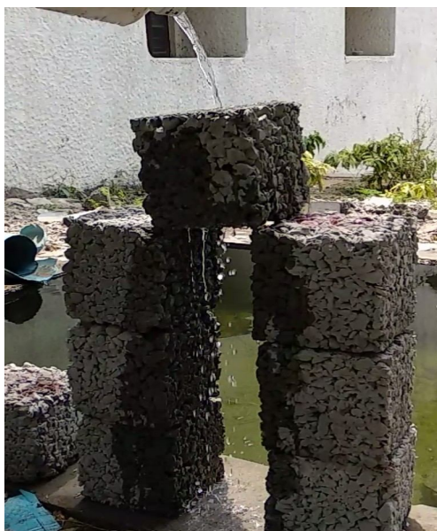
Figure no.4: Permeability of water

The compression strength test is ultimately used to calculate the compressive strength in \text{N/mm}^2 . In this project we preferred 7 th and 28 th days for curing and recorded compressive strength of pervious concrete and get the results in \text{N/mm}^2 .