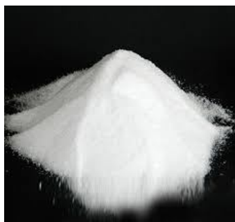
Figure no.2: Polyvinyl Alcohol (PVA)