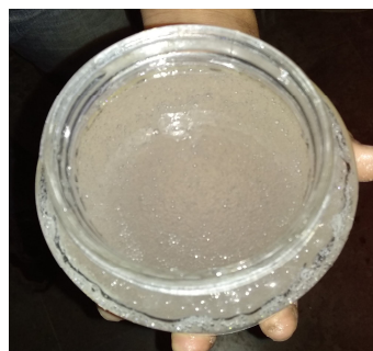
Figure no.3: Gel form of PVA