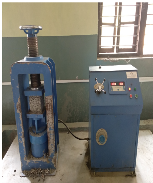
Figure no.5: compression strength machine