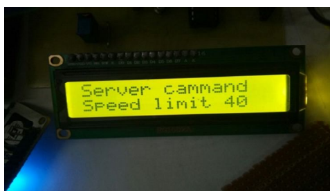
Fig.(3) Result for speed limit 40