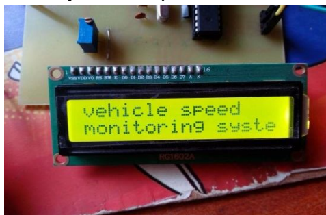
Fig. (1) real time vehicle speed monitoring system.