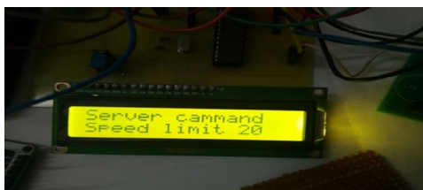
Fig.(2) Result for speed limit 20