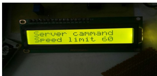
fig.(4) Result for speed limit 60