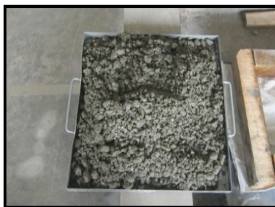
Fig-1: Fresh Concrete