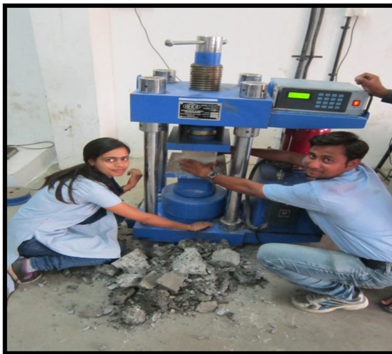
Fig-2: Checking compression of cubes