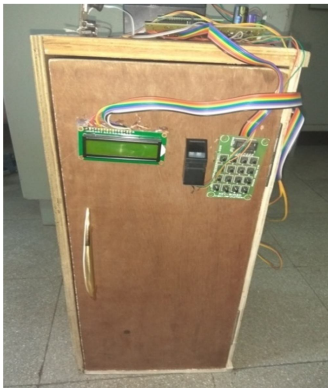
fig.(1) Hardware system