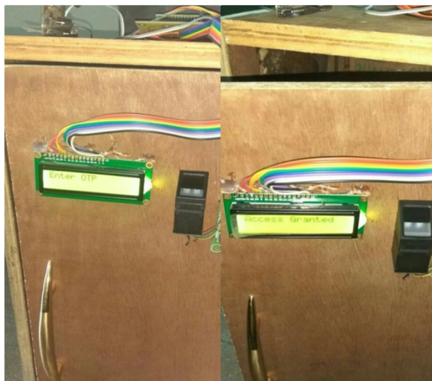
fig.(2) OTP Access