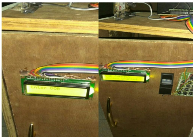
fig.(4) :-DOB Access