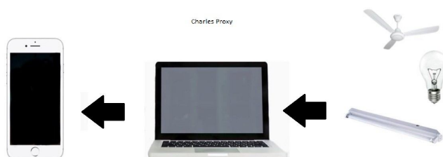
Figure 2: Prototype Architecture

Though, IoT devices send information to the destination (in this case the smart-phone), the computer will be able to see the data. Prototype dataset is prepared using this information and will also serve as input to test the prototype and try to identify the device that is communicating. Information received from a device is a communication file. eXtensible Markup Language (XML) or JavaScript Object Notation (JSON) formats are used by devices to send communication files. Some of the communication files, even with the Secure Socket Layer (SSL) certificate installed on Charles Proxy, remain encrypted and cannot be retrieved. Application for the prototype was developed using Iphone Operating System (iOS). The app receives the communication files and perform two main tasks: (i) create a database that will store the received communication files after some pre-processing; and (ii) identify the type of a device based on the received communication file. The application source code is available at [9] .