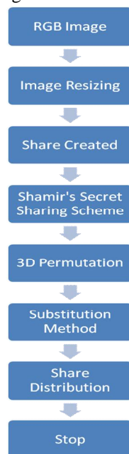
Figure 2. Flow Chart of Encryption Process

When an image is resized, its pixel information is changed. For example, a image is diminished in measure, any unneeded pixel information will be discarded by the photo editor (Photoshop). Exactly when a image is increased, the photo administrator must make and incorporate new pixel information - in light of its best guesses - to achieve a greater size which usually realizes either an exceptionally pixelated or sensitive and foggy looking image.