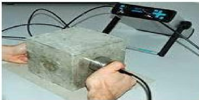
Figure 2 Ultra-Sonic Pulse Velocity