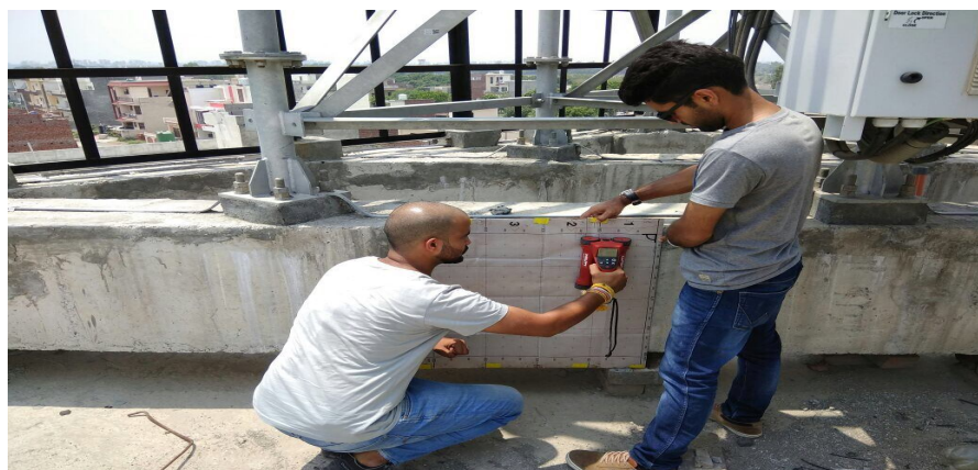
Figure 6 Conducting Ferro scanning of Beam 4