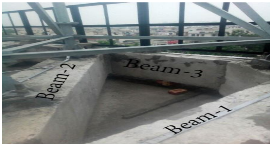
Figure 5 Beams nomenclature