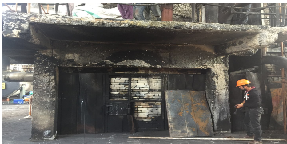
Figure 3 Fire hazardous fluid heating room at 1st Floor