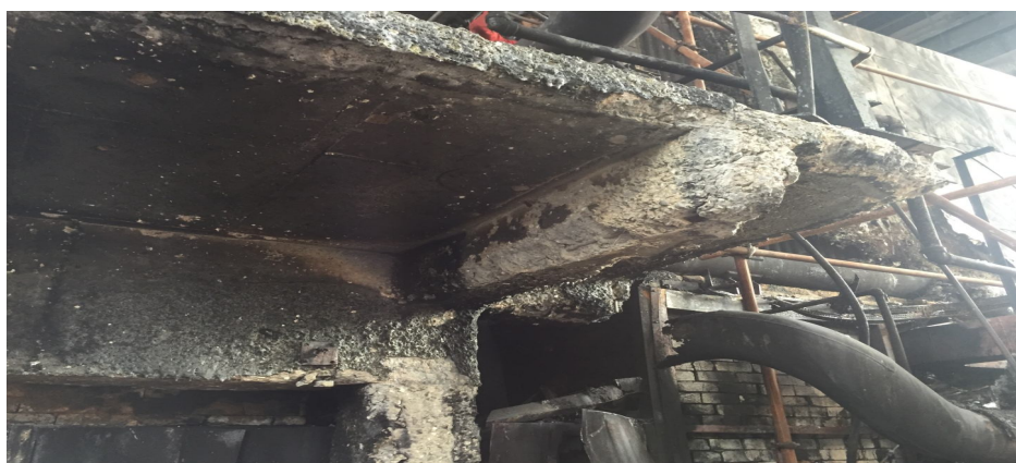
Figure 4 damaged beam and slab portion.