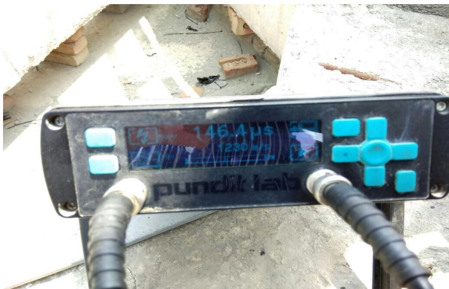
Figure7 UPV test