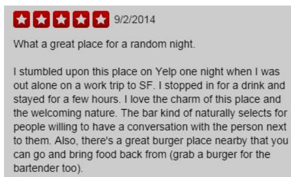
Fig. 4. Shows the snapshot of Yelp-Review Dataset

The yelp dataset contain review for each of the users posted on the yelp website. It also contains the longitude and latitude of the users for which they are provided review.