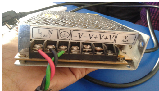
Fig. 1- SMPS