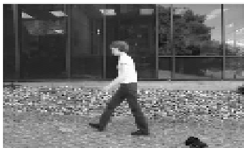
Fig 2. Captured Video