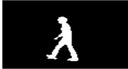
Fig 6 .Result of Background Subtraction