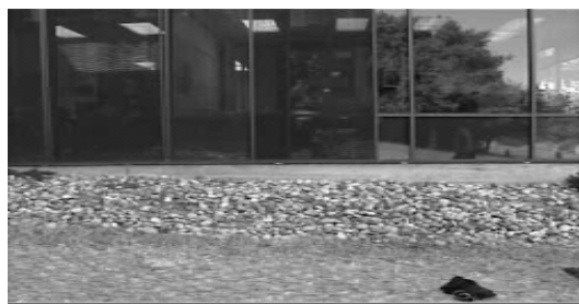
Fig 4. Reference Image

To perform background subtraction, we need a static reference image. Fig.4 shows the result of reference background image. Reference image contains image which has static information.