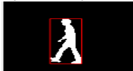
Fig 7 .Result of bounding box concept

It has rectangular shape .There are many more shapes also available. Fig 7 shows result of moving object with bounding box.