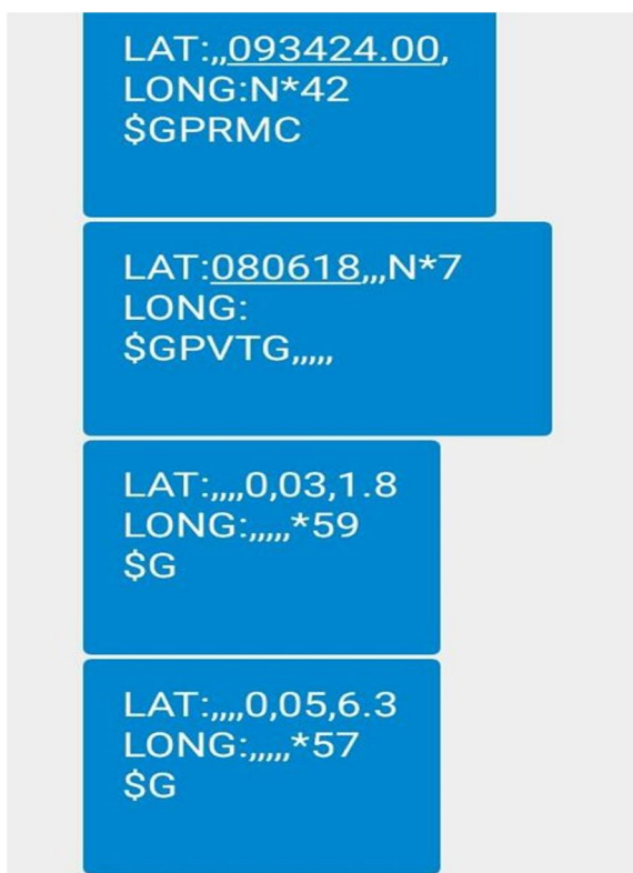
Fig 3 GPS location of latitude & longitude value