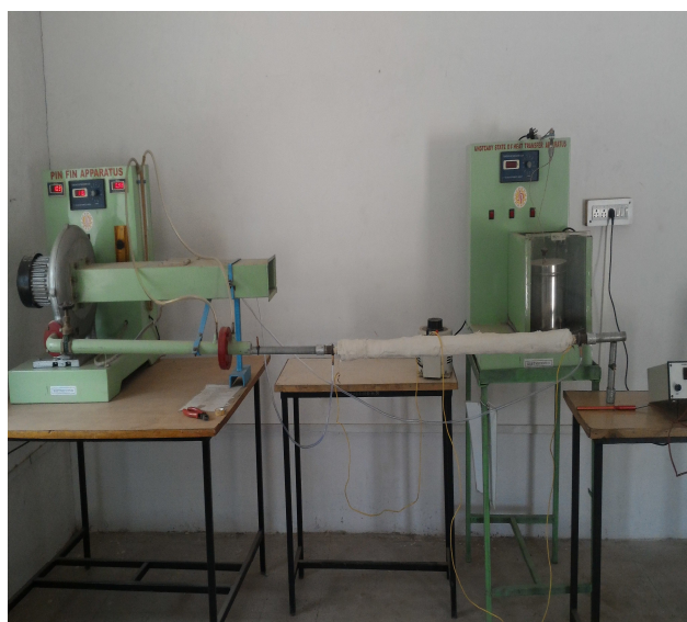
Fig.3.2: Experimental set up