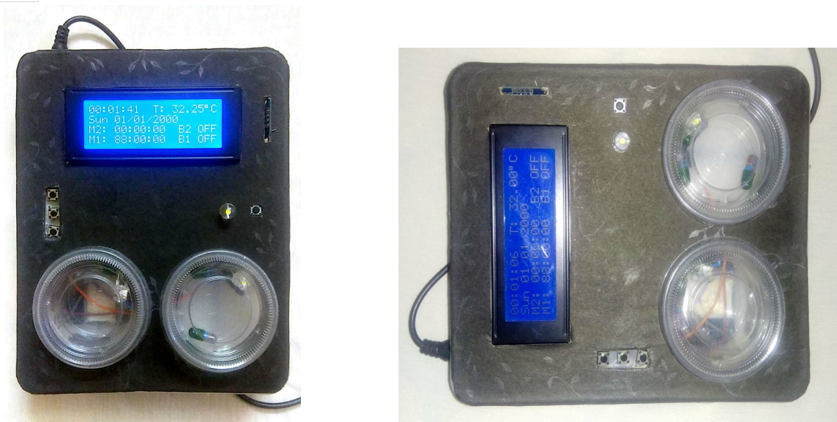
Fig. 2 Hardware model of medicine box